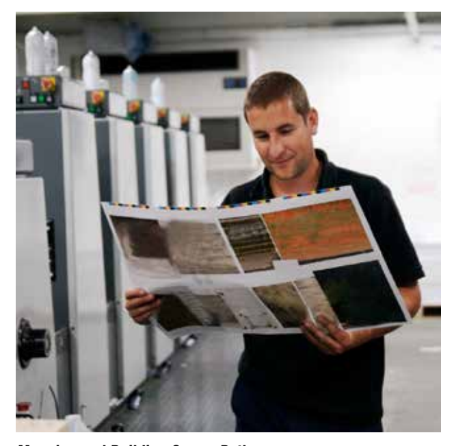
Mapping and Building Career Pathways Job-training programs can be a good investment for low-skilled workers, workers with an outdated skill set, and workers with other barriers to employment, especially in times of recession or low economic growth.