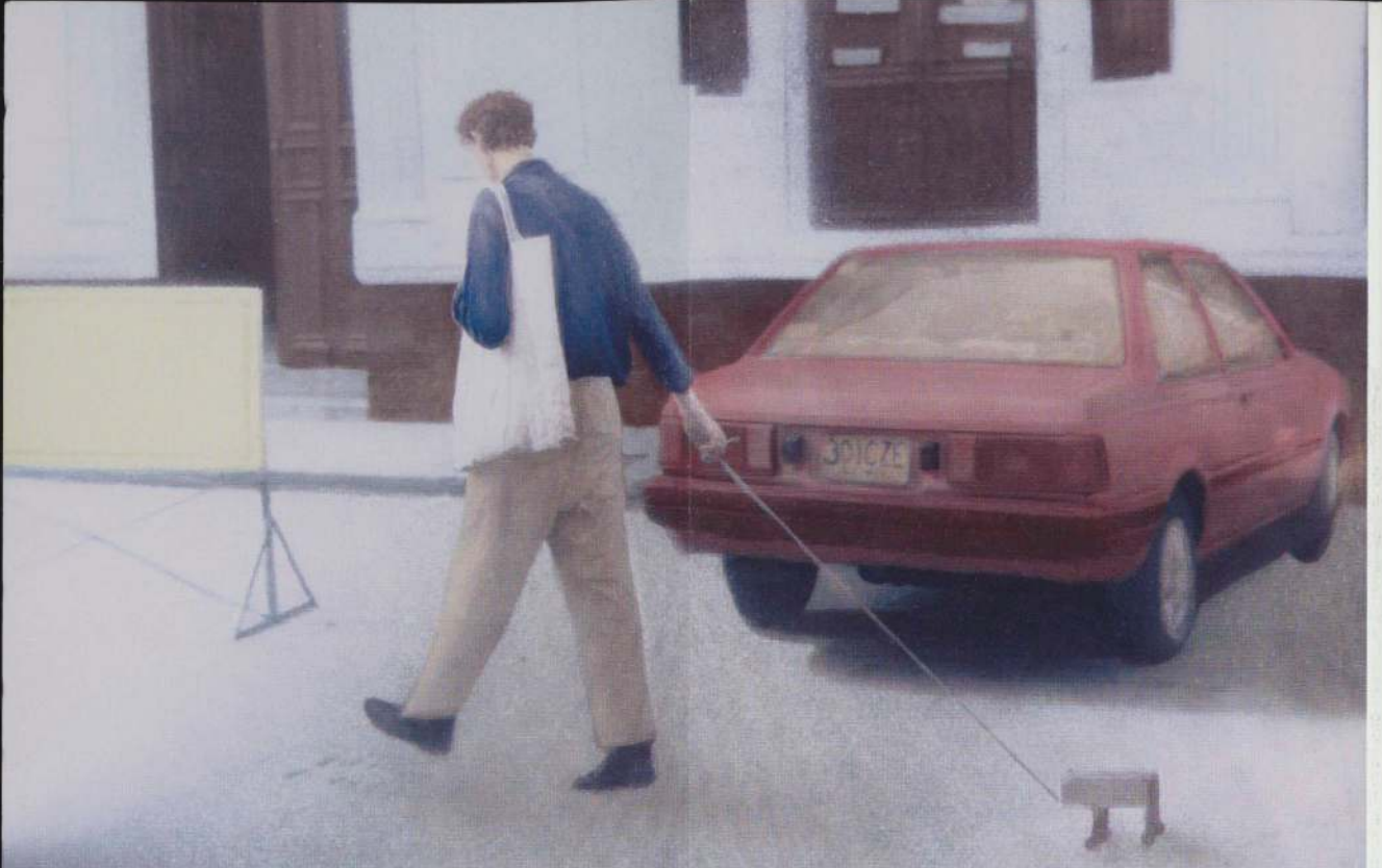
The Collector, Mexico City, 1991