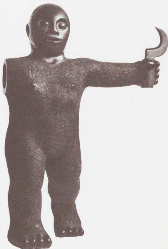
Detail of The Tables . 1986–87. Bronze.