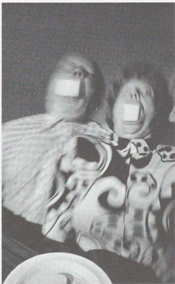
This side and reverse: Five untitled photographs from the series Mahlzeit . 1986–89. Gelatin-silver prints, each 67 x 42" (170 x 108 cm).