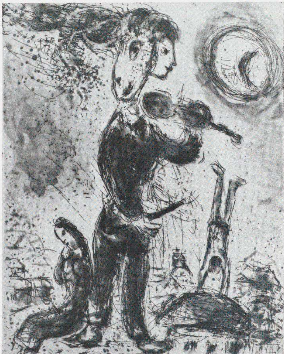
13. Violinist in Love.