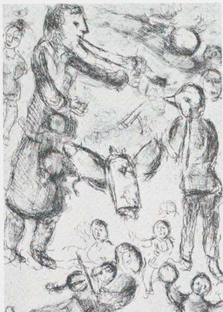
54. Psalm 18 from Psaumes de David .