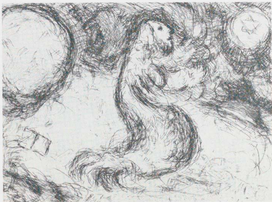
55. Psalm 16 from the album Psaumes de David .