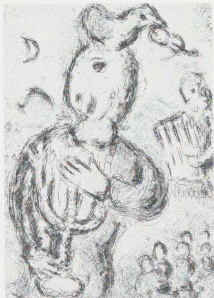
54. Psalm 13 from Psaumes de David .