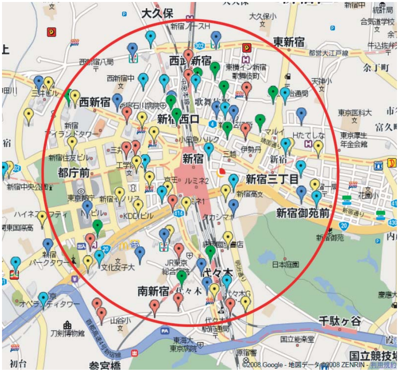
Figure 3: Convenience stores near Shinjuku station (blue: Seven-Eleven, red: Lawson, green: FamilyMart, yellow: am/pm, light blue: CircleKSunkus)